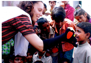
A Sambhavna volunteer communicates via puppets with children in one of the affected communities

The gifts of time and talent given by an array of volunteers from across the world, including many from the affected areas in Bhopal, are also a central part of what allows Sambhavna to thrive. Volunteers can apply their skills in many areas: